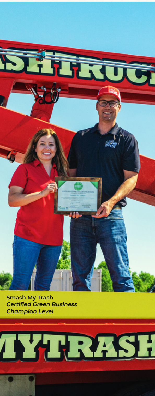
Smash My Trash Certified Green Business Champion Level

Find more information about our network at nvgreenbusiness.org , along with our annual impact reports, training videos, webinars, and green resources.